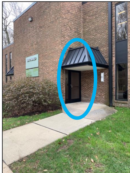
Office outside entrance