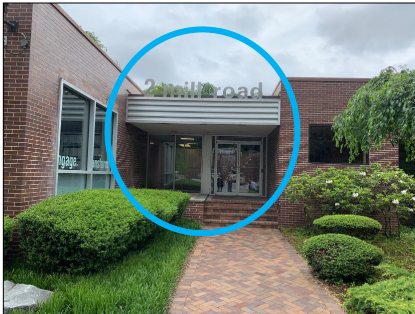
Office outside entrance